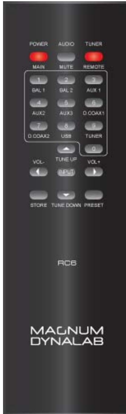
IMAGE OF RC6 REMOTE