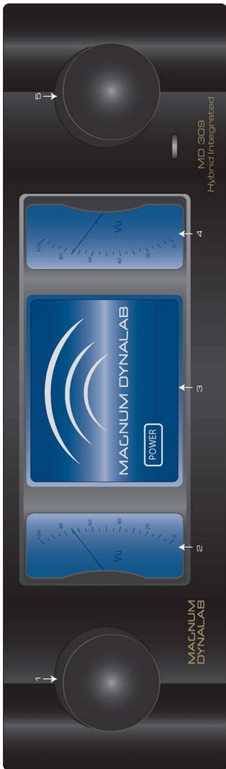
DIAGRAM OF MD 309 HYBRID INTEGRATED AMPLIFIER