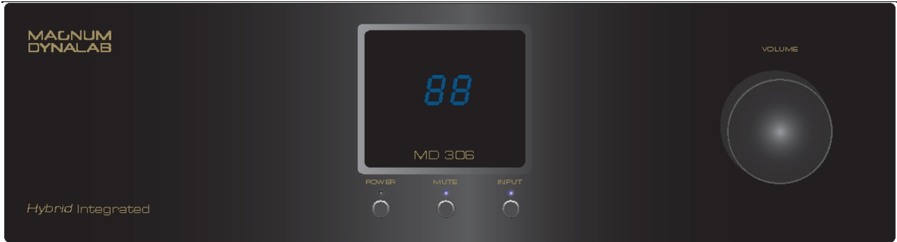
DIAGRAM OF MD 306 HYBRID INTEGRATED AMPLIFIER