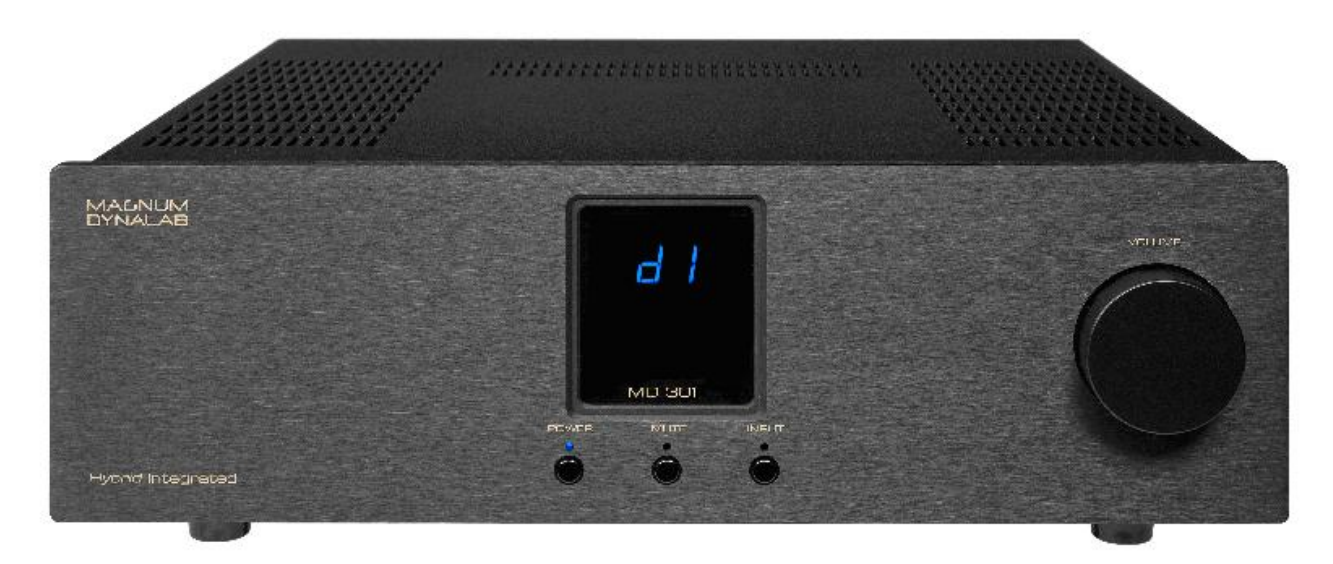
DIAGRAM OF MD 301 HYBRID INTEGRATED AMPLIFIER