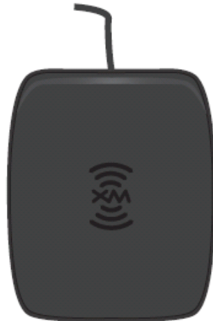
Figure 4. XM Antenna