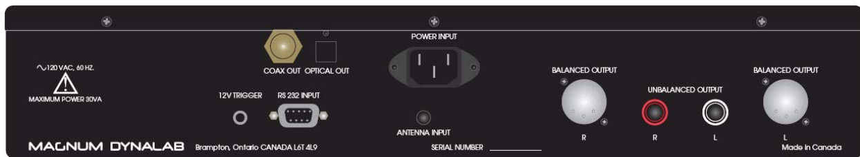
Figure 2. MD-606T Rear Panel Features