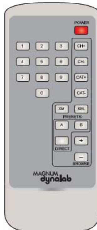
Figure 3. MD-606T Remote Control Features