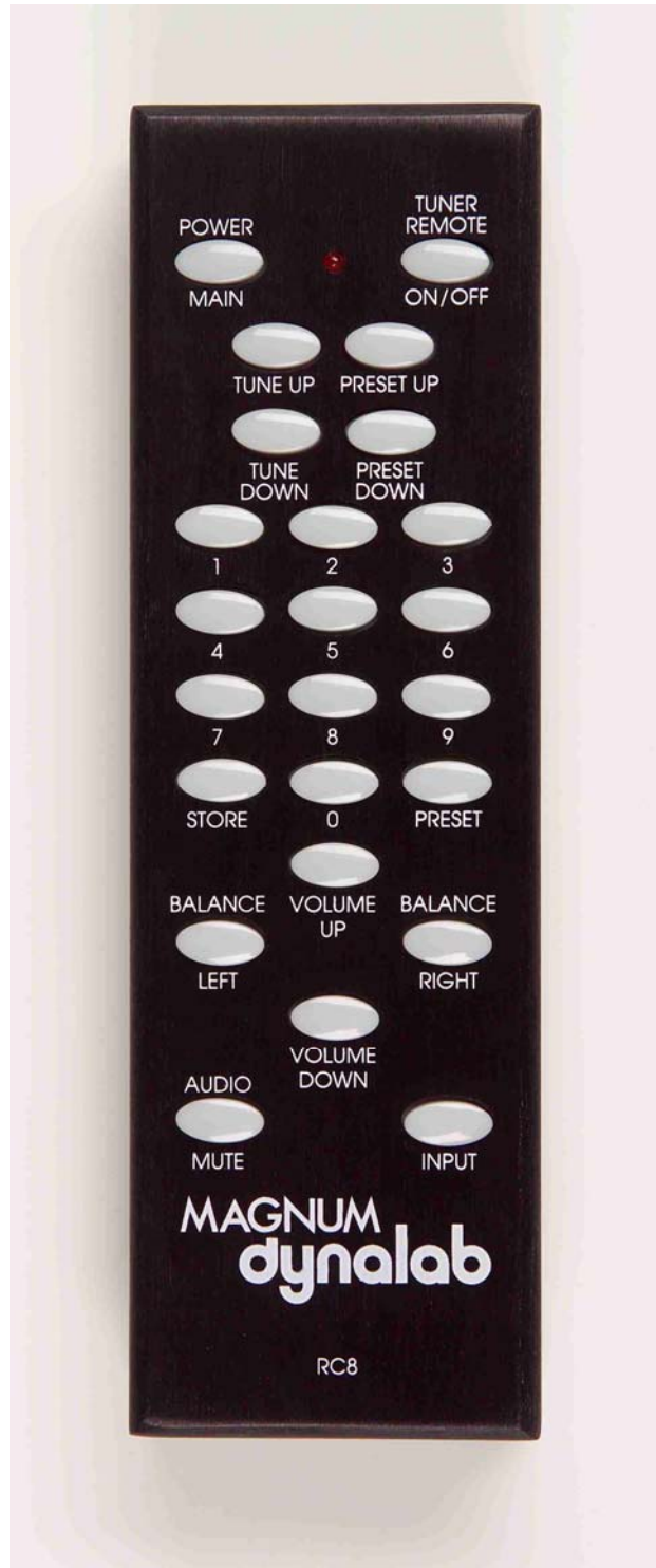
IMAGE OF RC8 REMOTE