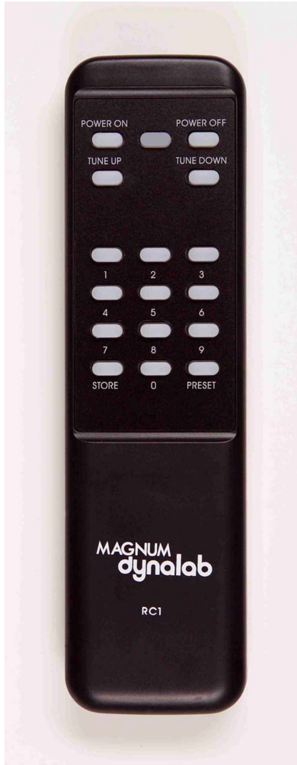
IMAGE OF RC1 REMOTE